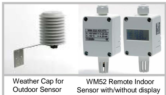
Weather Cap for Outdoor Sensor

Many other configurations are available. Please consult PMC